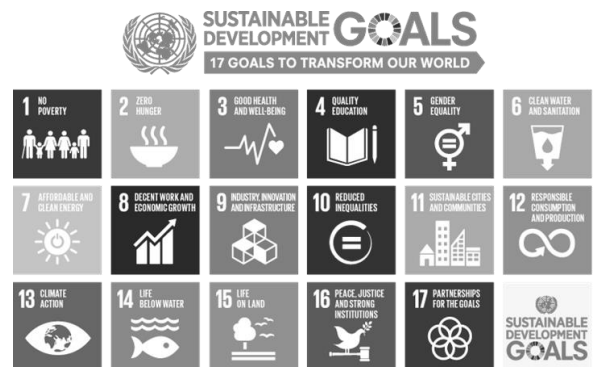
U.N. Sustainable Development Goals

The goal framework also includes procedural Goals, such as building efficient, credible, and transparent institutions (SDG 16) and strengthening and promoting open, participatory, and democratic processes as a means of implementing them (SDG 17).