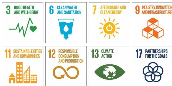
Goals associated with ICMA categories

Noval Property’s operations in relation to SDG Goal 7 “Affordable and clean energy,” Goal 9 “Industry, innovation and infrastructure,” Goal 11 “Sustainable cities and communities” and Goal 12 “Responsible consumption and production” presents the largest positive impact. Through the corporate positive impact on the aforementioned goals, Noval Property’s operations also contribute to Goal 13, “Climate Action”.